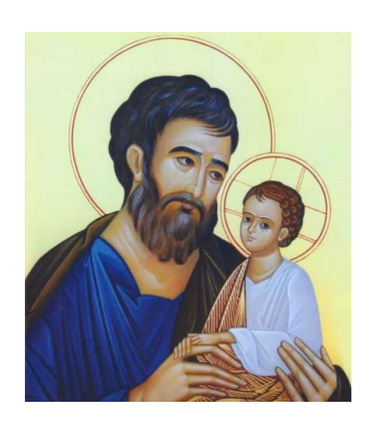
4th Sunday of Lent

2330 Margaret St, Philadelphia, PA 19137, (215) 535-4978 www.stvalentinespncc.org, stvalentinespncc@gmail.com Facebook: StValentinesPNCCPhiladelphia YouTube: St. Valentine's PNCC Parish Philadelphia Sunday Mass: 9: 30 AM (English/Polish)