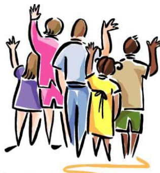
Say Goodbye to Our Pastor and Family

And it means that everyone's patience, understanding and cooperation will be necessary. So, if your pastor is being transferred, pray for him and his new ministry. Keep in mind that he was ordained to serve the needs of the entire Diocese and the entire PNCC, and not just your parish. If you've benefited from his ministry, thank him, and thank God. And welcome your new pastor too; support and encourage him. Of course, he won't be identical to your former pastor and undoubtedly, he won't be perfect. But if you wait for a perfect priest, the pulpit in your church will be empty for a long, long time.